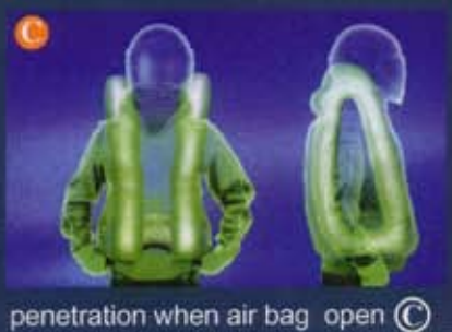
penetration when air bag open (C)