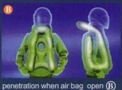
penetration when air bag open (B)