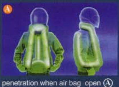
penetration when air bag open (A)